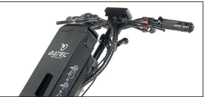
27 km* autonomy with 36 V – 280 Wh battery. 44 km* autonomy with 36 V – 576 Wh battery. 4A charger.