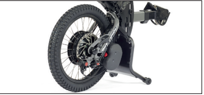
18" Wheel, ultra-grip tyre and aluminium double-wall rim.