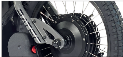
Removable right dropout for easy inner tube or tyre change.