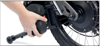
Removable QR weights.