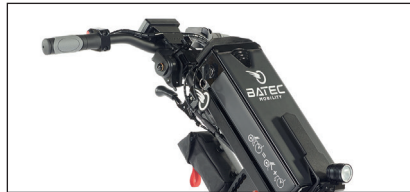
55 km* autonomy with 48 V - 768 Wh battery. Delivered with ultra-fast 3A charger.