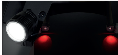
700-lumen front light with position lights / high beam options. Dual LED tall light on the stand frame.