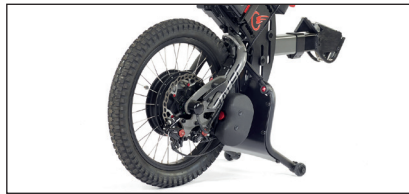
Ultra-grip tyre 18" x 2.40". Black double-wall aluminium rim.