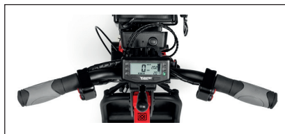
G&B handlebar option without levers for quadriplegics.