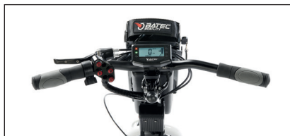
Handlebar option with right or left Monolever brakes for hemiplegics.