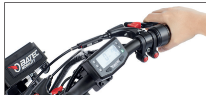
180 mm disc, two mechanical brakes, two aluminium levers with parking brake.