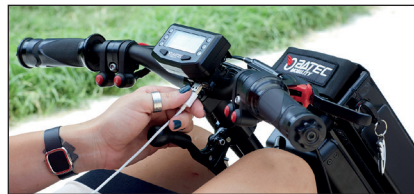
All-in-one LCD screen with gear selector. Horn and USB port.