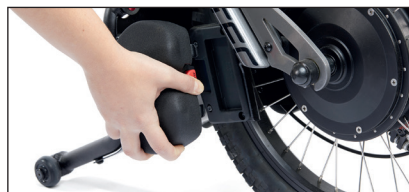
Removable QR weights.