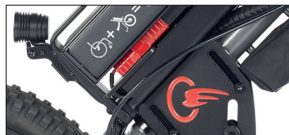
Graphite with red trim.