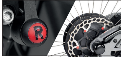
300 RPM 1200W high torque brushless motor with reverse gear. Maximum speed 30 Km/h.