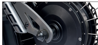
Removable right dropout for easy inner tube or tyre change.