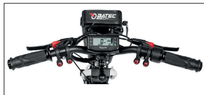
Matte black aluminium handlebar with folding system for convenience.